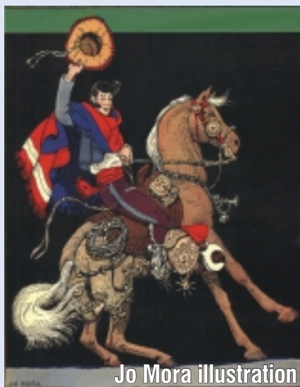
Jo Mora illustration