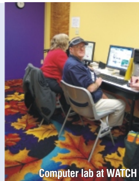
Computer lab at WATCH