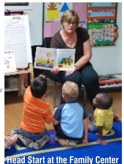
Head Start at the Family Center