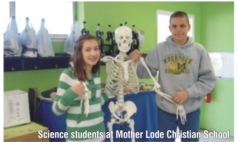
Science students at Mother Lode Christian School

logistics of the grants and really bend over backwards to make supporting the community easy.”